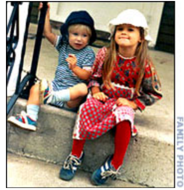
Jacob, left, with his older sister Amy, now 26.

The plan seemed sound to Jerry. More important perhaps was that Jerry knew October 22, 1989 had been a tough one for Jake. His son had skated poorly at hockey tryouts for his youth league in nearby St. Cloud. Renting the comedy "Naked Gun" might be just the thing to lift Jacob's spirits. Jerry decided to allow Jacob and Trevor to ride to the Tom Thumb. It was the first time the two boys had permission to ride after sundown.